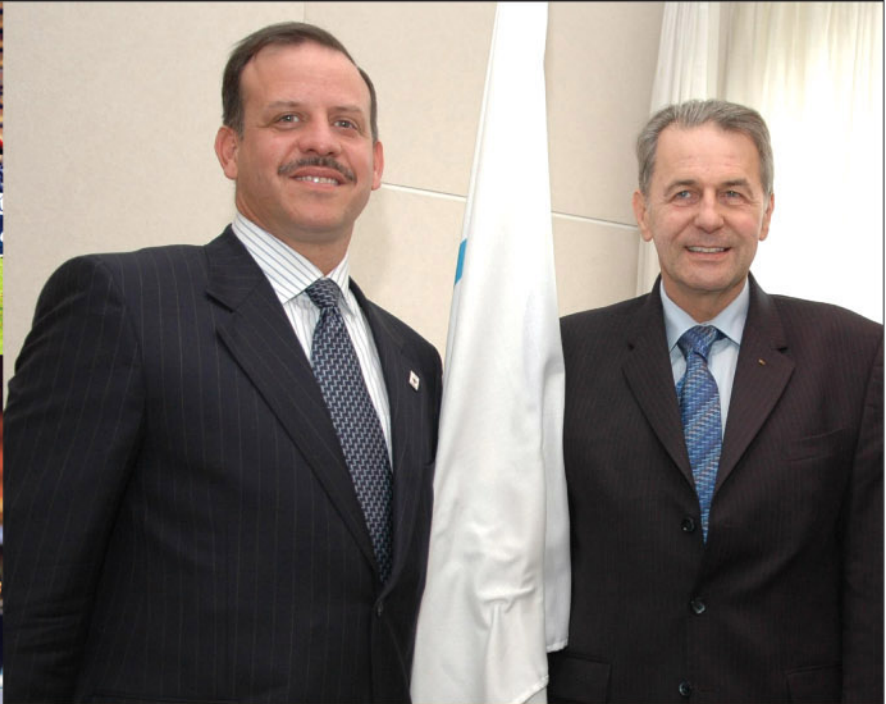
JORDAN'S WORK IN THE FIELD OF WOMEN AND SPORT HAS FURTHER STRENGTHENED THE RELATIONSHIP BETWEEN HRH PRINCE FEISAL AND DR. JACQUES ROGGE